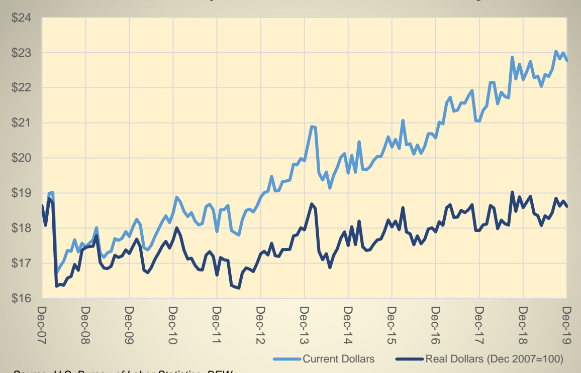
S.C. Average Hourly Wage Trade, Transportation, and Utilities Industry