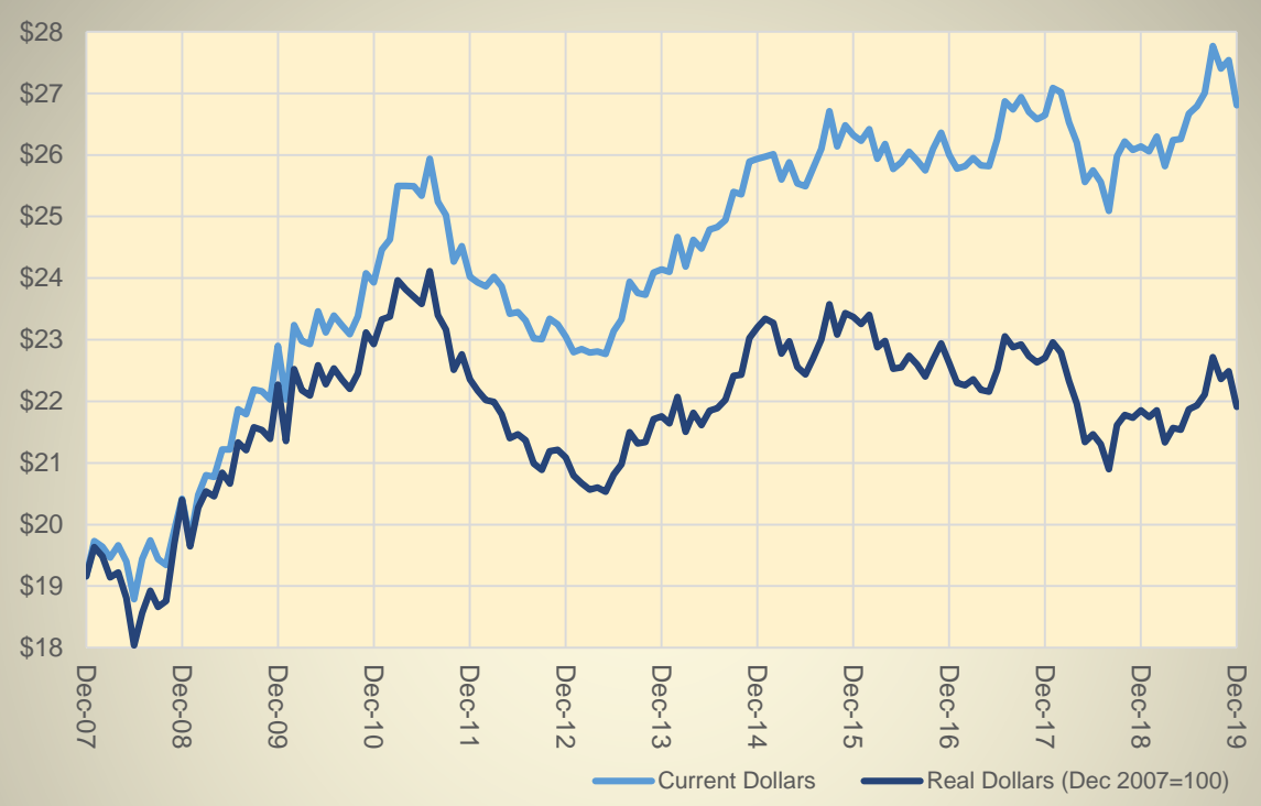
S.C. Average Hourly Wage Education and Health Services Industry