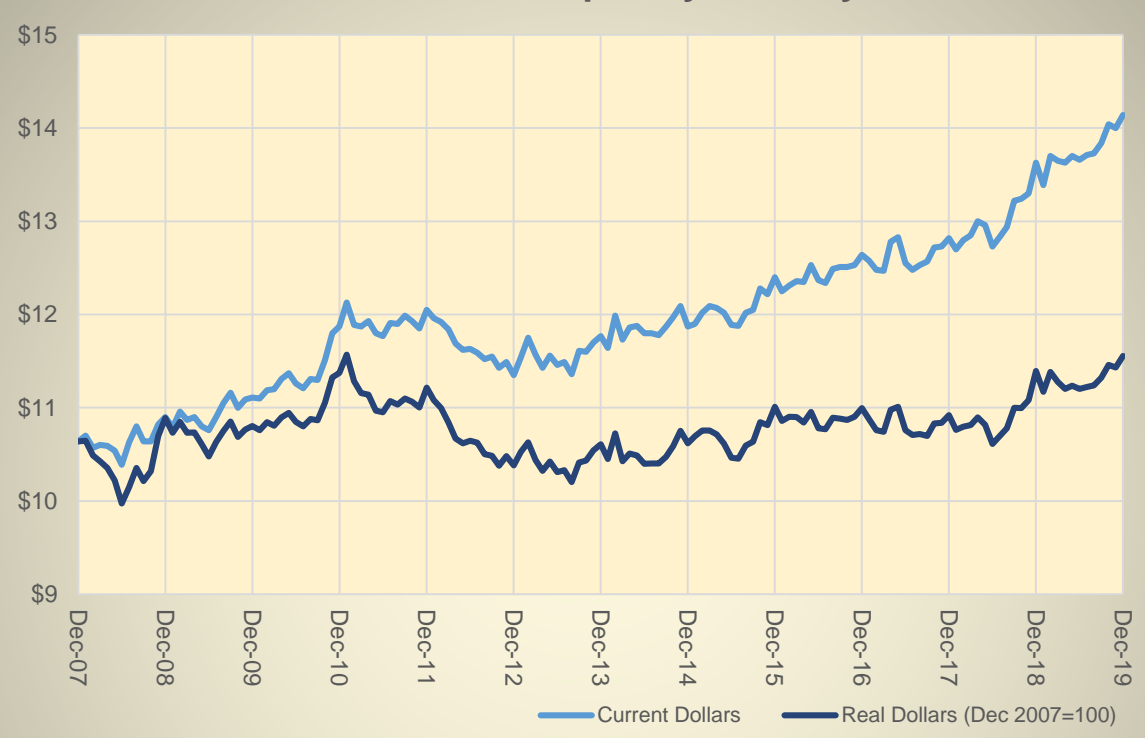
S.C. Average Hourly Wage Leisure and Hospitality Industry