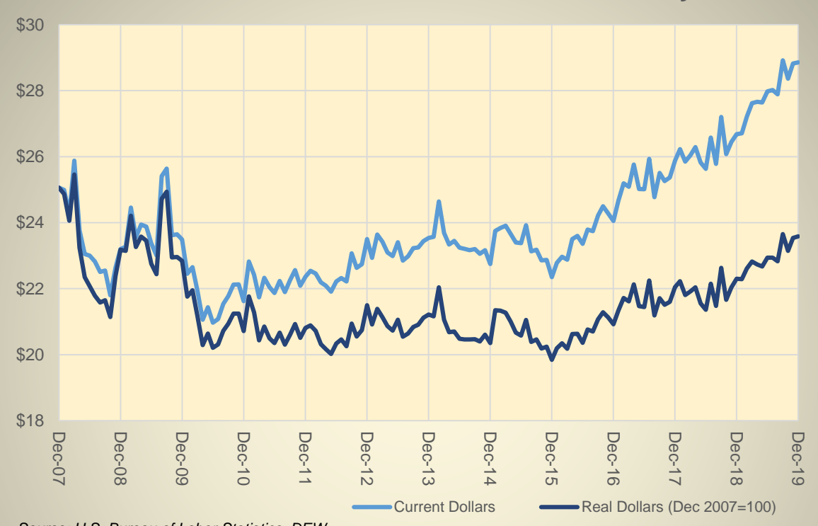
S.C. Average Hourly Wage Professional and Business Services Industry